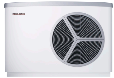
WPL 25 AC

The WPL 25 AC and WPL 25 ACS air source hydronic heat pumps offer an affordable entry into the energy transition for your home. Specifically engineered for outdoor installation, STIEBEL ELTRON focused on keeping the operating sound of these heat pumps to a minimum and offer the quietest system in the market.